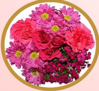
Devotion 6 Stems $10

Proceeds from the sale of flowers help women facing a crisis pregnancy.