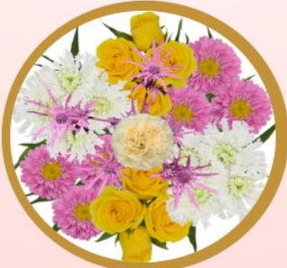
Super Mom 8 Stems $15