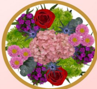
Bella 14 Stems $20

The Women's Centers of Greater Chicagoland Chicago † Des Plaines † Evergreen Park Phone: 773-794-1313 www.GoTWC.org